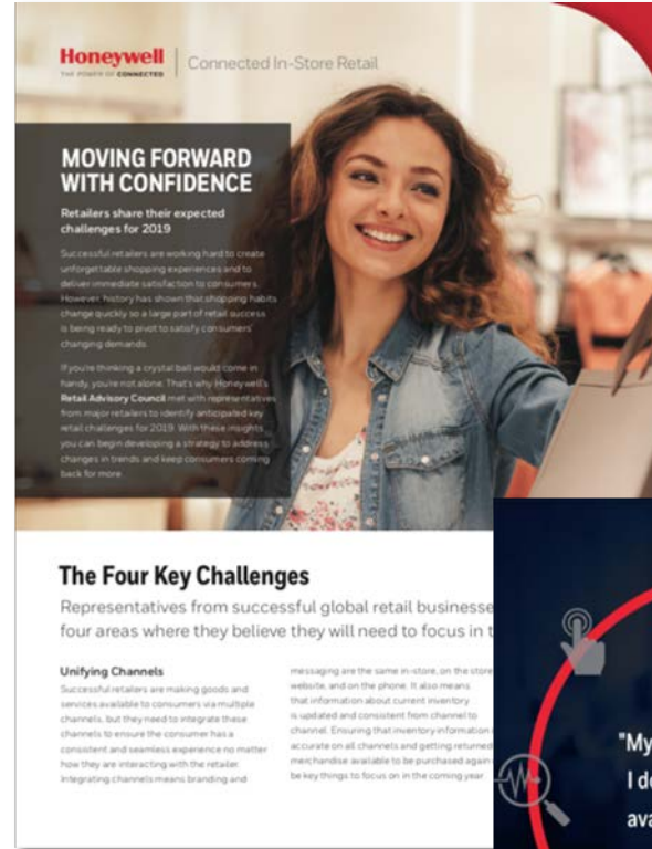
Retail Advisory Council NRF