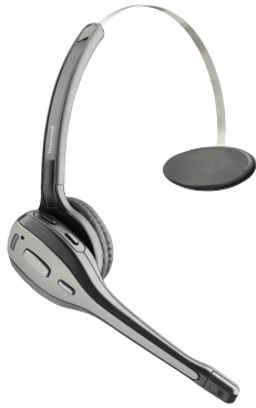
CT40 mobile computer with Honeywell Guided Voice application and SRX SL headset

» Click Here to learn How to Clean Honeywell's General-Purpose Scanners and Disinfectant-Ready Products