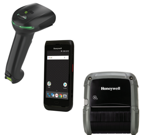
Xenon XP 1952-g-bf scanner, CT40 mobile computer and RP4e mobile printer

Switching to a curbside model allows for their shoppers to get the products they need while adhering to social distancing recommendations. 4