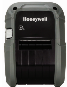
CT60 Handheld Mobile Computer and RP2 Rugged Label Printer