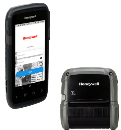
Honeywell CT60 Mobile Computer with Honeywell Smart Talk and RP4 Mobile Printer

Honeywell CT60 mobile computers are designed for delivery drivers that require real-time connectivity to business-critical applications. At every doorstep, the CT60 mobile computer enables the driver to scan the items and verify delivery with photos or SMS which can be sent to the customer as proof-of-delivery. The CT60's sound recorder application can also capture the customer's voice as a signature instead of requiring them to touch the device, resulting in a contactless delivery. The CT60 scan engine reads barcodes that are damaged or poorly printed at non-traditional fulfilment centers with ease, ensuring that packages that would not have been delivered reach their destination.